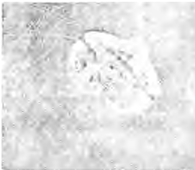
Gymnodinium breve magnified to 1450 times natural size. Note the trailing flagellum (difficult to see at lower left) lies in the clearly visible transverse groove of the organism. The pale areas are bright green chloroplasts.

where the station is operating at present, provided more adequate facilities, and also made it possible to begin a more concentrated study of Tampa Bay and the adjoining area of the Gulf. This type of careful regular examination of a more localized Red Tide area is providing more definite information on the sequences of physical, chemical, and biological events which are associated with the appearance and disappearance of "blooms" (development of massive algal concentrations) of G. breve . A marked relationship was noted between rainfall (and resultant land drainage) and occurrences of dense G. breve populations; outbreaks occurred only during years in which rainfall was well above normal.